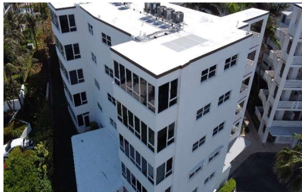
NW EXTERIOR WALL