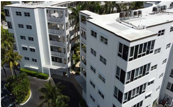
WEST EXTERIOR WALL