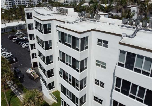
SOUTH EXTERIOR WALL