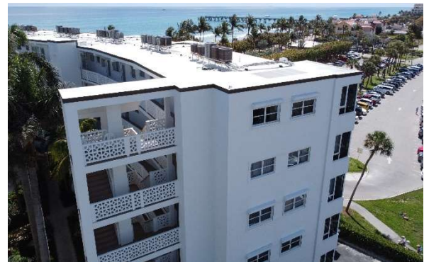
WEST EXTERIOR WALL