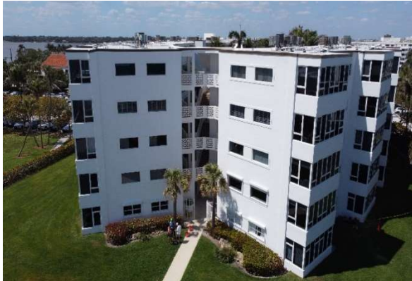
EAST EXTERIOR WALL