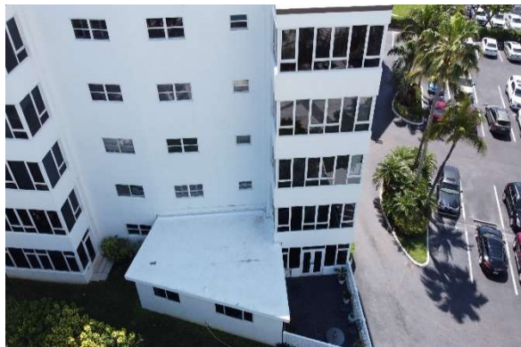
NW EXTERIOR WALL