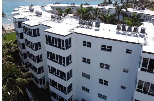
NORTH EXTERIOR WALL