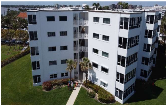
EAST EXTERIOR WALL