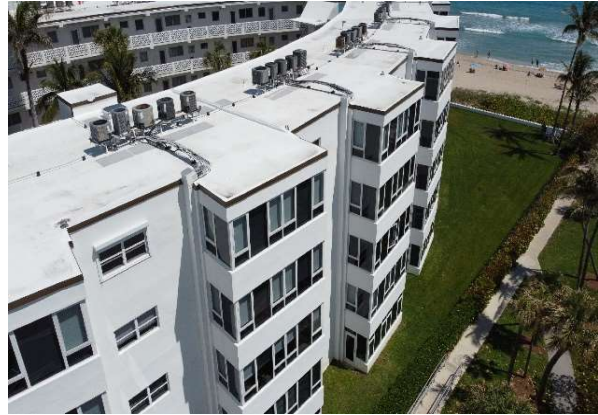
SOUTH EXTERIOR WALL