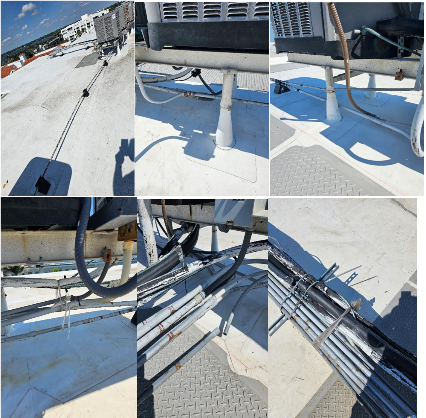
Pipes are to be secured with roof mounts. Not tied with string or plastic. All pipes are to be repaired and secured.