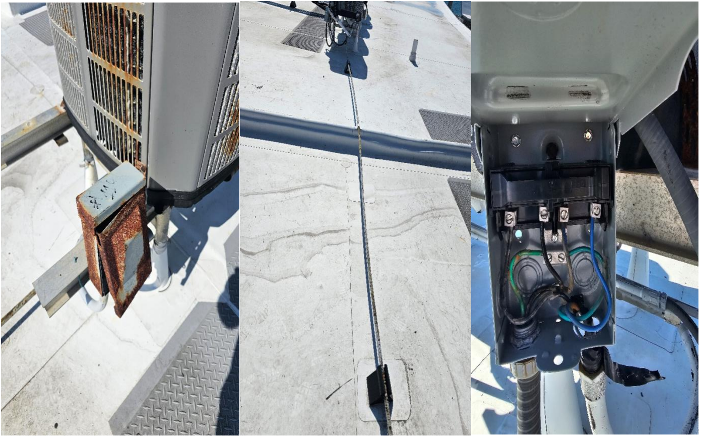
All disconnects are to be complete and not missing parts.