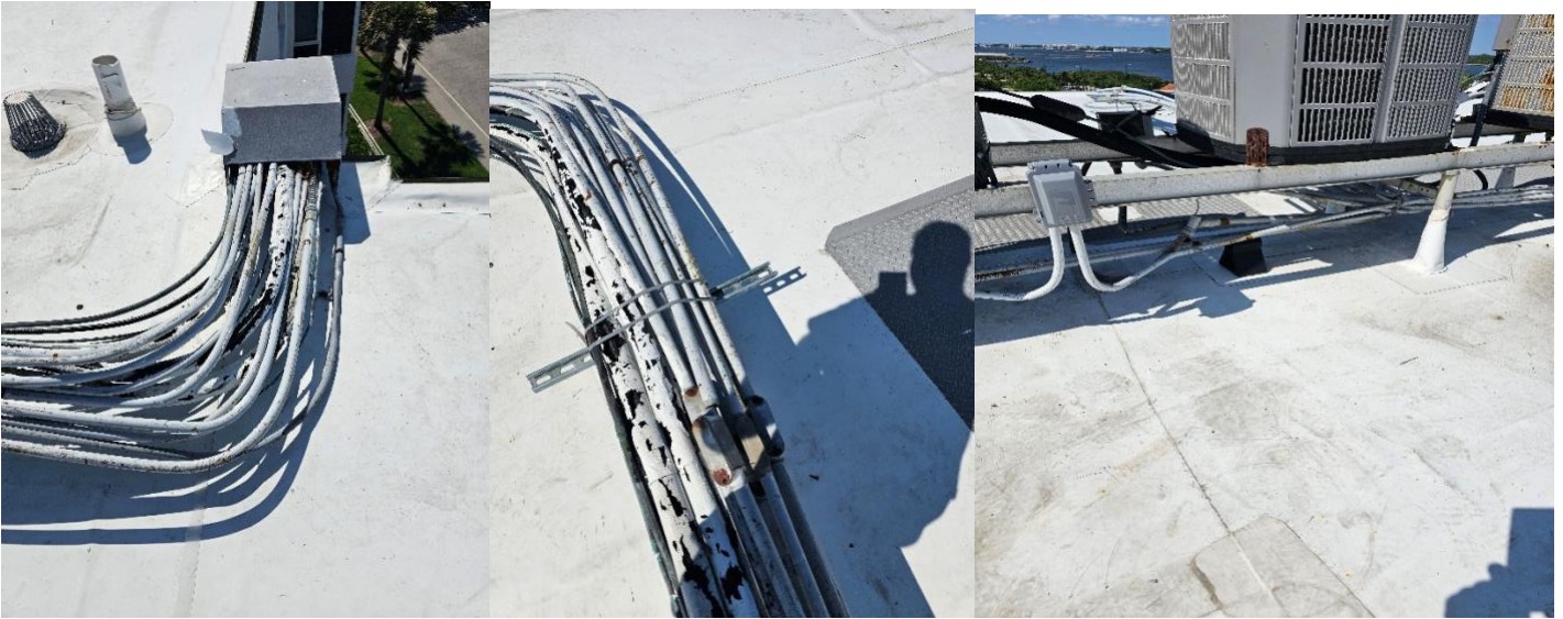
Pipes are to be secured and not blowing in the wind. Pipes are to be attached to Unistrut with Unistrut straps. Not zip ties. Pipes are not to be secured with cloth to the racks.