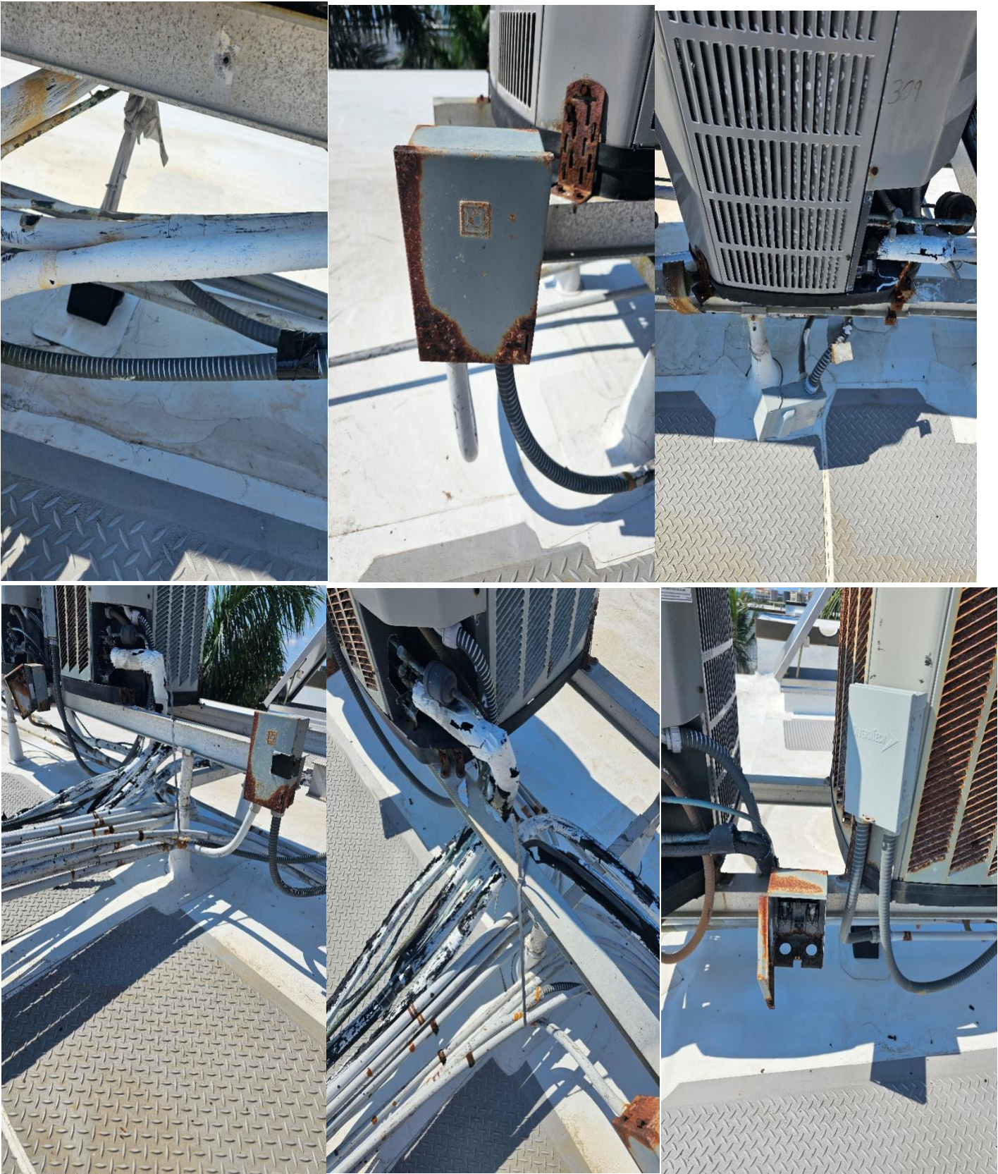
Any abandoned disconnects or conduits are to be removed.