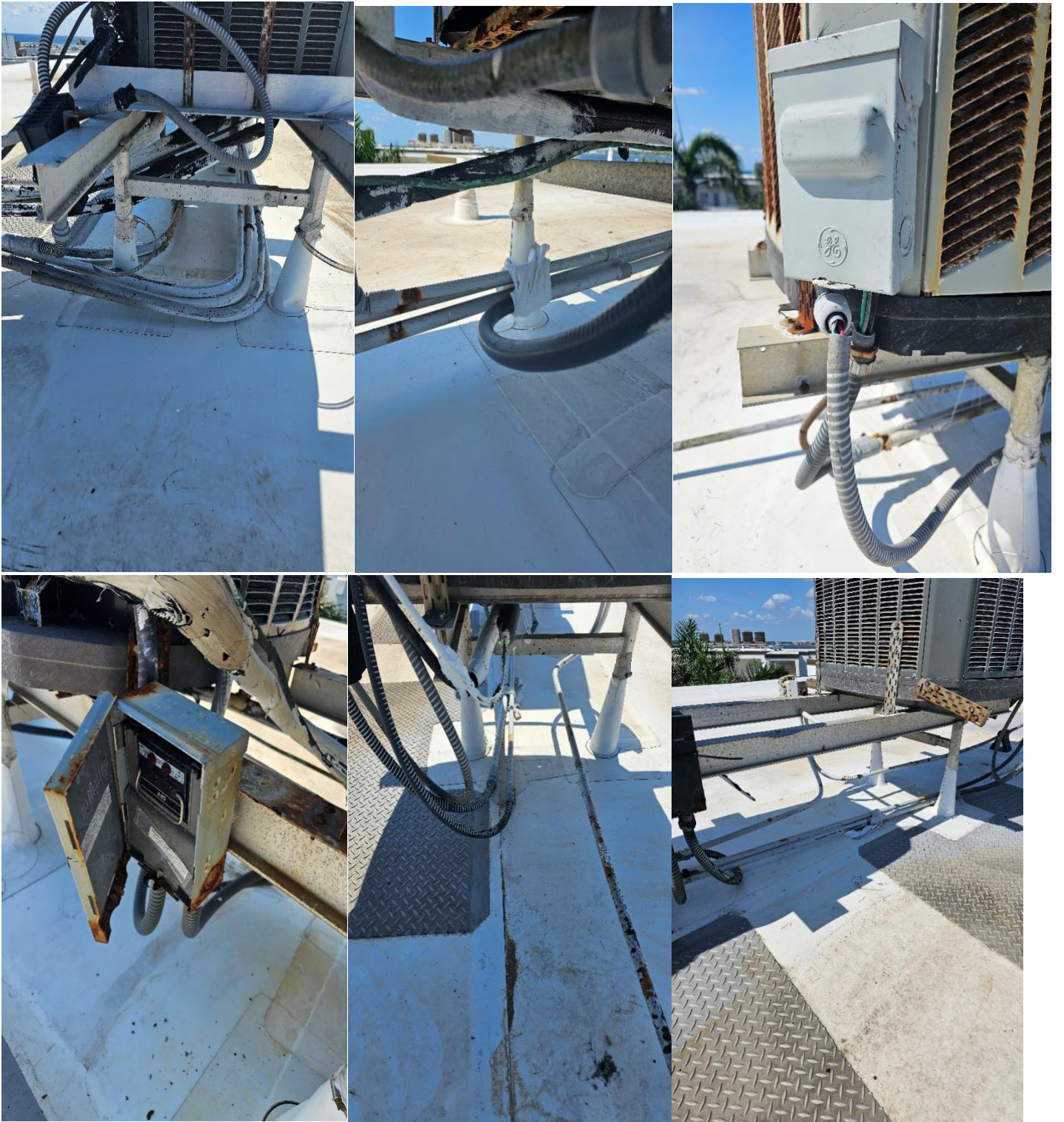
Any disconnects with rusted holes in them are to be replaced. Pipes are not to be just left sitting on the roof.